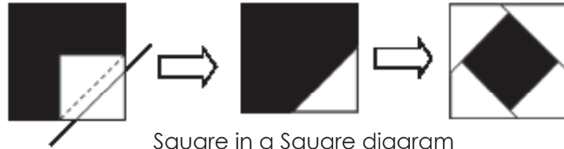
Square in a Square diagram White and Black are reversed in diagram for clarity

Place a 2" square right sides together onto the bottom right corner of the 3 ½" square. Draw a diagonal line from corner to corner as shown. Sew along drawn line. Cut off excess fabric ¼" above seam line. Press the stitched block open. Repeat this process with the other 2" squares on the remaining three corners so that you have a pieced square in a square unit as shown on the Square in a Square Diagram below.